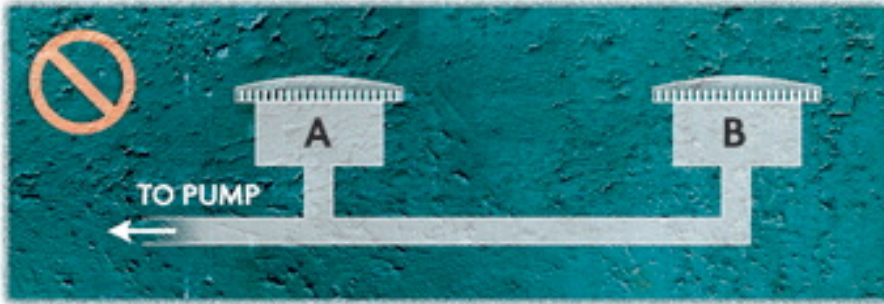
Illustration A: These drains have been placed in series, with the tee set under Drain A. The drains can't pull equally. Drain B is weaker. If Drain A were to become blocked, its counterpart may not be able to prevent a vacuum from forming.