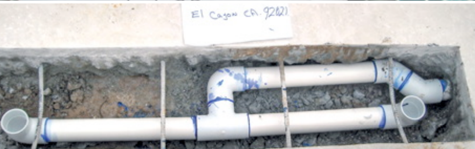
The right and wrong way: Service professional Javier Payan photographs each drain configuration he inspects, with the address included in the frame. In the top photo, the drains are not balanced, with the tee sitting below the right outlet. Cutting pipes on another site, middle, shows they are clogged with concrete, rendering one of the drains useless. At bottom, a properly re-plumbed dual-drain system, with the tee set in the middle.